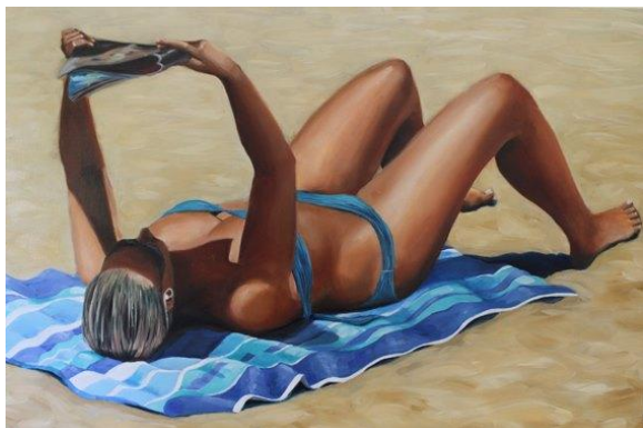
Heading OS - Sunbaker by Liz Pasqualini

Art + 1 showcased art works from 9 members and received very positive feedback from a number of sources. Special mention and congratulations goes to Liz Pasqualini who sold 2 of her paintings from Art + 1 to an overseas buyer. A little bit of the Northern Beaches is about to be shipped to the USA!