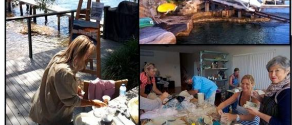
From Pittwater's Edge Art Workshop brochure

For more information about 'Pittwater's Edge Workshops' email Cindy at cindy@mmilman.com.au or visit www.cindygoodemilman.com .