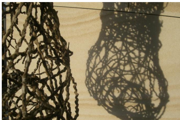
Cherry's work in progress